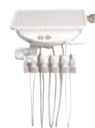
Cabinet Module Air or Electric versions