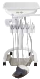
Mobile Cart Air or Electric versions