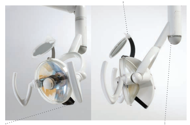
ON/OFF Touchless sensor and soft-push button (with light intensity indicator) for Composite Curing Safe Mode and two light intensity settings: Low – 18,000 Lux and High – 28,000 Lux. 4200 Kelvin

\ensuremath{\text{SP-A}} cuspidor unit with extendable and rotating Assistant's console