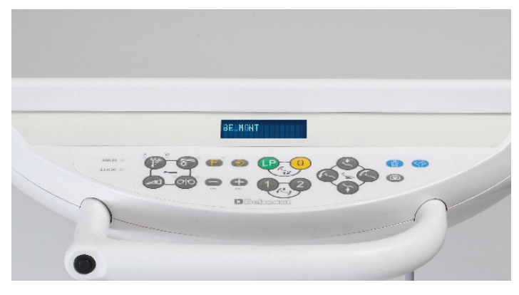
'E' version control panel includes instrument, chair, spittoon and light controls