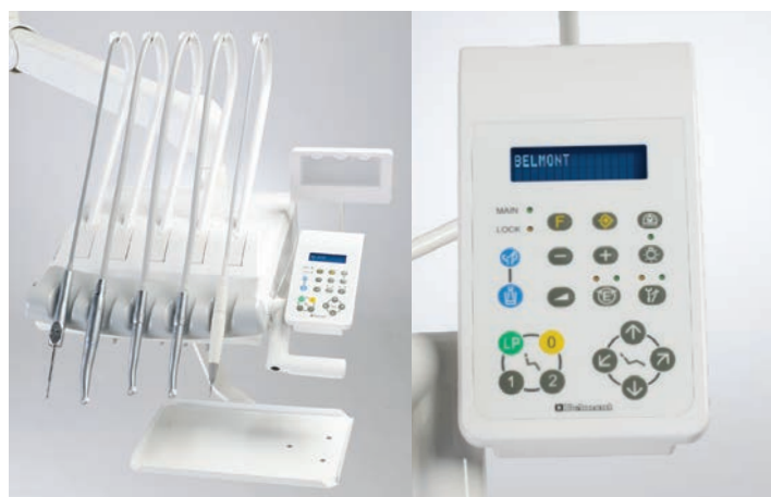
Continental Rod type Operator's console ('E' version)

<sup>1</sup> NDL-PG unit-mounted operating light also available / <sup>2</sup> Applies to 'E' versions only and when using a 720S Operating light Ceiling-mounted NDL and 700 Series lights also available, see 'Operating Lights' on pages 48-51