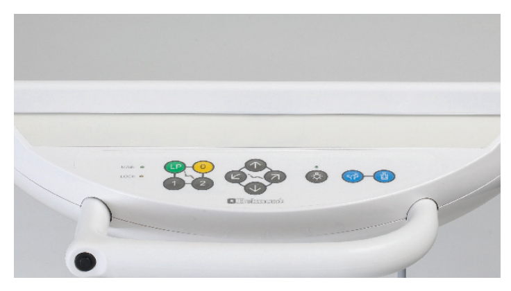
'A' version control panel includes chair and spittoon controls

Control all chair movements by hand or foot: by hand from both the Operator's and Assistant's console; by foot using the foot control. Spittoon functions and ON/OFF light control<sup>1</sup> are also activated from both the Operator's and Assistant's console.