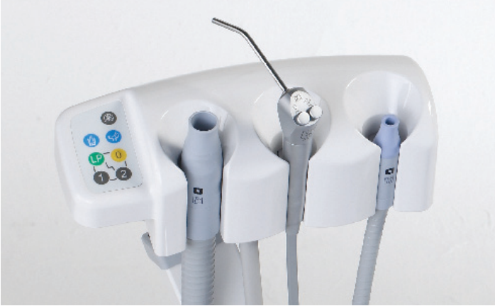
Assistant's console with chair, cuspidor and light<sup>2</sup> controls