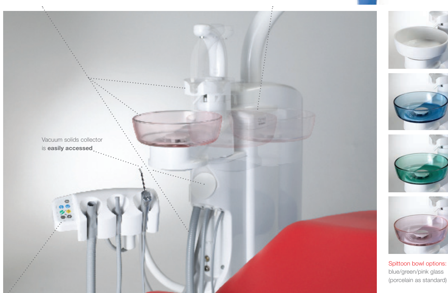
Assistant's console with chair, spittoon and light<sup>1</sup> controls