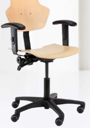
Score At Work PU