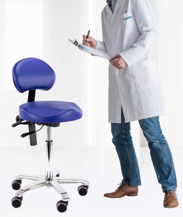
with Ergo shape seat