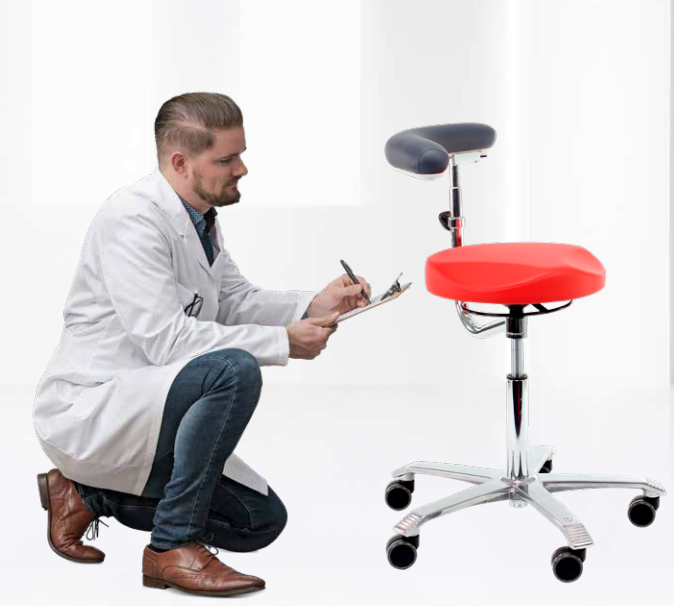
Medical 6360 with ergo shape