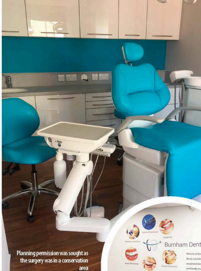
Planning permission was sought as the surgery was in a conservation area

located on the high street. The building has a standard it has to meet with regards to the appearance, as the town is keen to retain some of its charm and character in amongst modernisation.