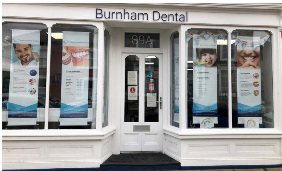
Determined to make it a success, Jasdeep recruited additional specialists during lockdown

Jasdeep says: 'The practice is part of the conservation list and is conveniently